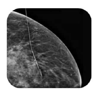
Mammogram confirming placement of the wire localization.

In the operating room, the anesthesiologist will give you a general anesthetic. The surgeon will then make an incision, follow the wire to the lesion and remove the wire and the area of tissue surrounding it.